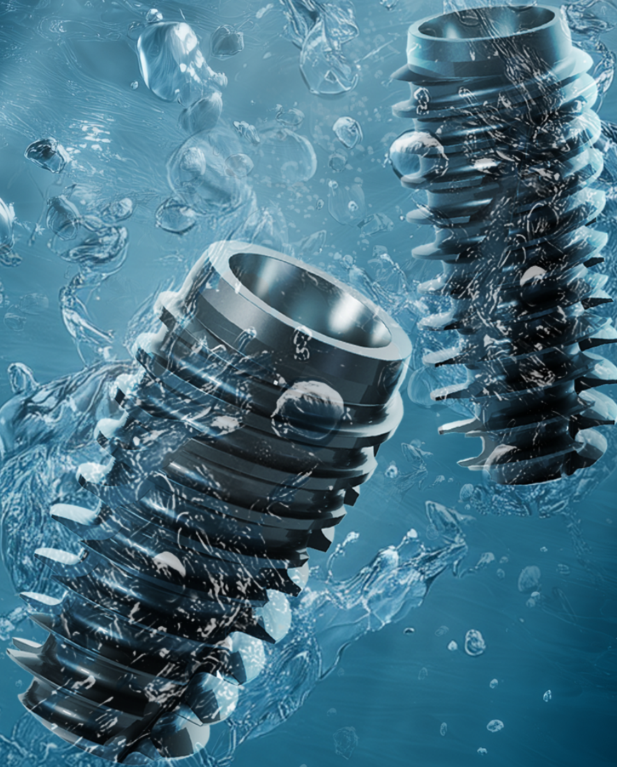
Implant cell adhesion