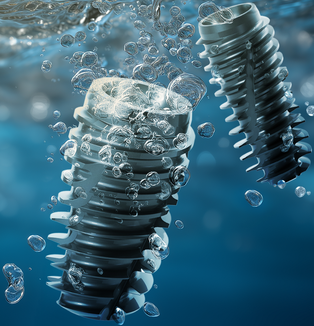
Implant cell adhesion